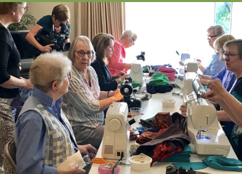
Above & Left - Sewing workshop being filmed for Channel 3's "Do Something Good."