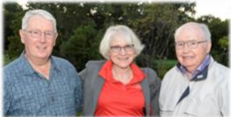
CALS Deans at Corn Roast picnic.

Don't miss out on a jolly time. Join in at 1:00pm on Thursday, November 18. If you have friends without access to Zoom, consider inviting them to join you to LAUGH OUT LOUD: IT FEELS SOOOOOO GOOD! A Zoom link will be sent to all Demeter members with email addresses about one week before the event.