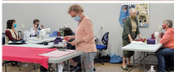
Sewing Workshop in its new workspace at Blue Bar Quilts

Our sewing group met in September, after sewing and cutting at home for a year and a half. It was a productive and social day! Everyone was happy to be together again. We are trying some new patterns this year to add to our scarves and caps. We meet the 3 rd Tuesday from 10-4 in the classroom at Blue Bar quilts in Middleton. It is very generous of Gael to let us use this wonderful space. Thank you to all of the Demeter members who have given donations to our sewing group. The hospital is always very much in need of our monthly delivery.