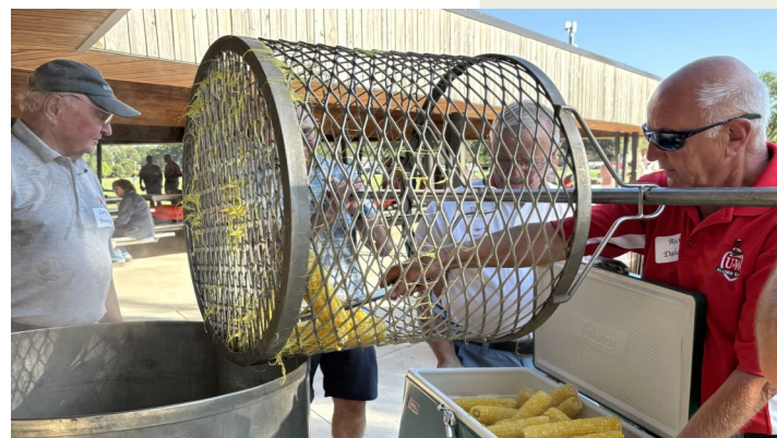
Teamwork makes for a great corn roast.

"They have excelled in carrying out their tasks," he said.