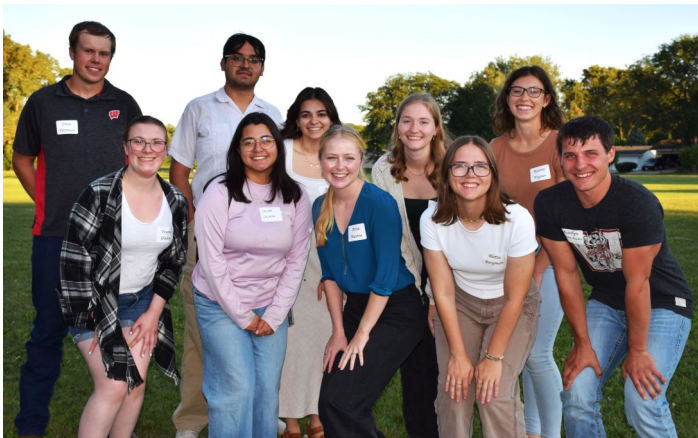
Representatives from several agricultural clubs receiving Demeter support attended the corn roast picnic. Clubs represented were the Crops Club, the Food Science Club, the Society for the Advancement of Chicanos & Native Americans in Science, and the UW-Madison chapters of the Wildlife Society, the American Society of Agricultural and Biological Engineers and the National Agri-Marketing Association.