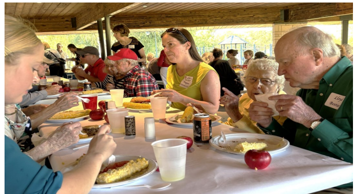
Demeter brings together generations of UW/CALS members and students.

Demeter welcomes all persons interested in the agricultural and life sciences. Visit DemeterWI.org for more information.