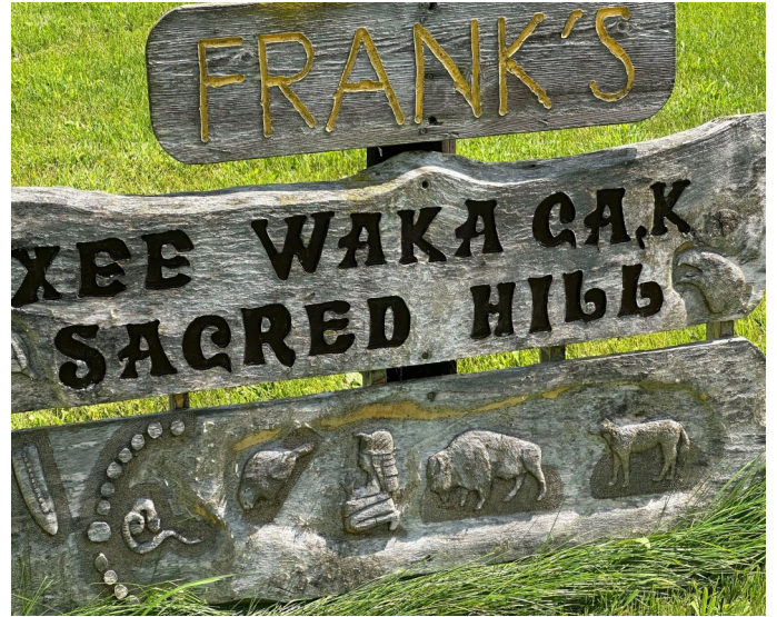
Underneath the mounds at Frank's Hill was a carved sign representing a coiled snake, a beaver, a bird, a bison and a coyote.

The shores of the river were alive with many birds: Cedar waxwings, Blue jays, Cardinals, Baltimore Orioles, Eagles, Red-headed woodpeckers, Kingfishers, Bank Swallows, Cliff Swallows and Great Blue Herons. Common Map Turtles were resting on fallen trees along the shoreline. We stopped for a picnic lunch on a large sand bar.